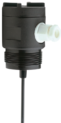
CP-1C Probe Holder supplied with 1 x 1 metre rod