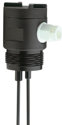
CP-2C Probe Holder supplied with 2 x 1 metre rods