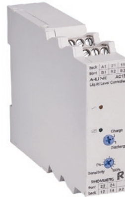
DIN Rail AC130