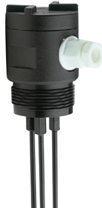
CP-3C Probe Holder supplied with 3 x 1 metre rods

Note: All CP kits interface directly with Rhomberg SC130 & AC130 level relays